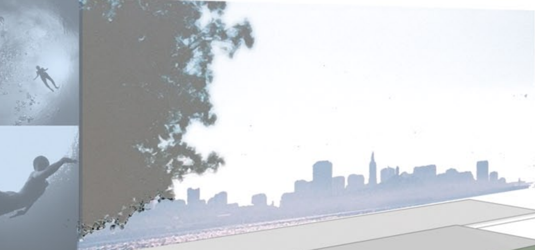
100YR FLOOD PLAIN HIGH TIDE LEVEL