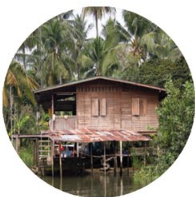
100YR FLOOD PLAIN LOW TIDE LEVEL